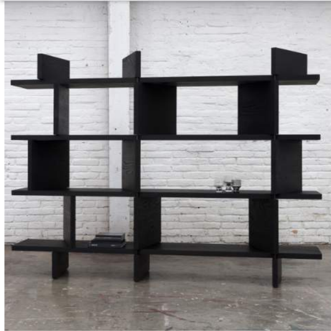
Because of its modular design, Cartela can be built in two heights: a 177-centimetre bookshelf and an 88-centimetre credenza.