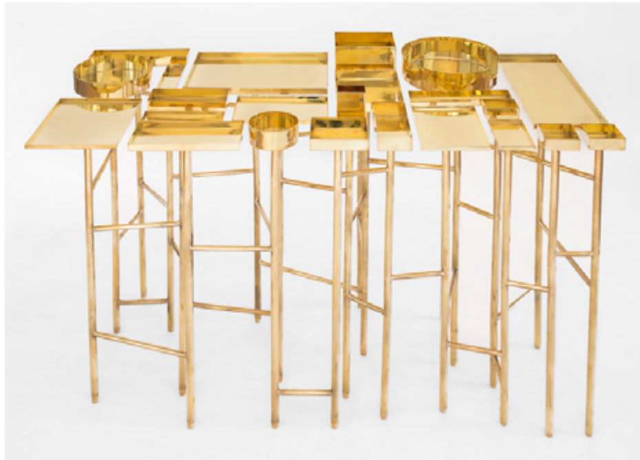
Compartments that form the top of this table by Mexican design studio Esrawe allow belongings to be meticulously organised (+ slideshow).