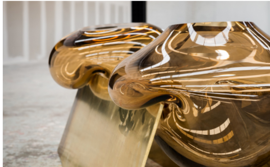
The 'Precarious' design.

The untitled collection is composed of five different strands, each with a distinctive approach to glass work and materiality. At Zona Maco, the series 'Precarious' is the most represented, and consists of glass pieces formed around steel and brass plates, co-existing in a delicate calibration. 'The contrast is quite severe,' affirms Thoreen, whose previous solo collection 'Unsettled' debuted at Patrick Parrish in New York last year. 'The glass is transparent, while the plates are rougher and less refined,' he continues.