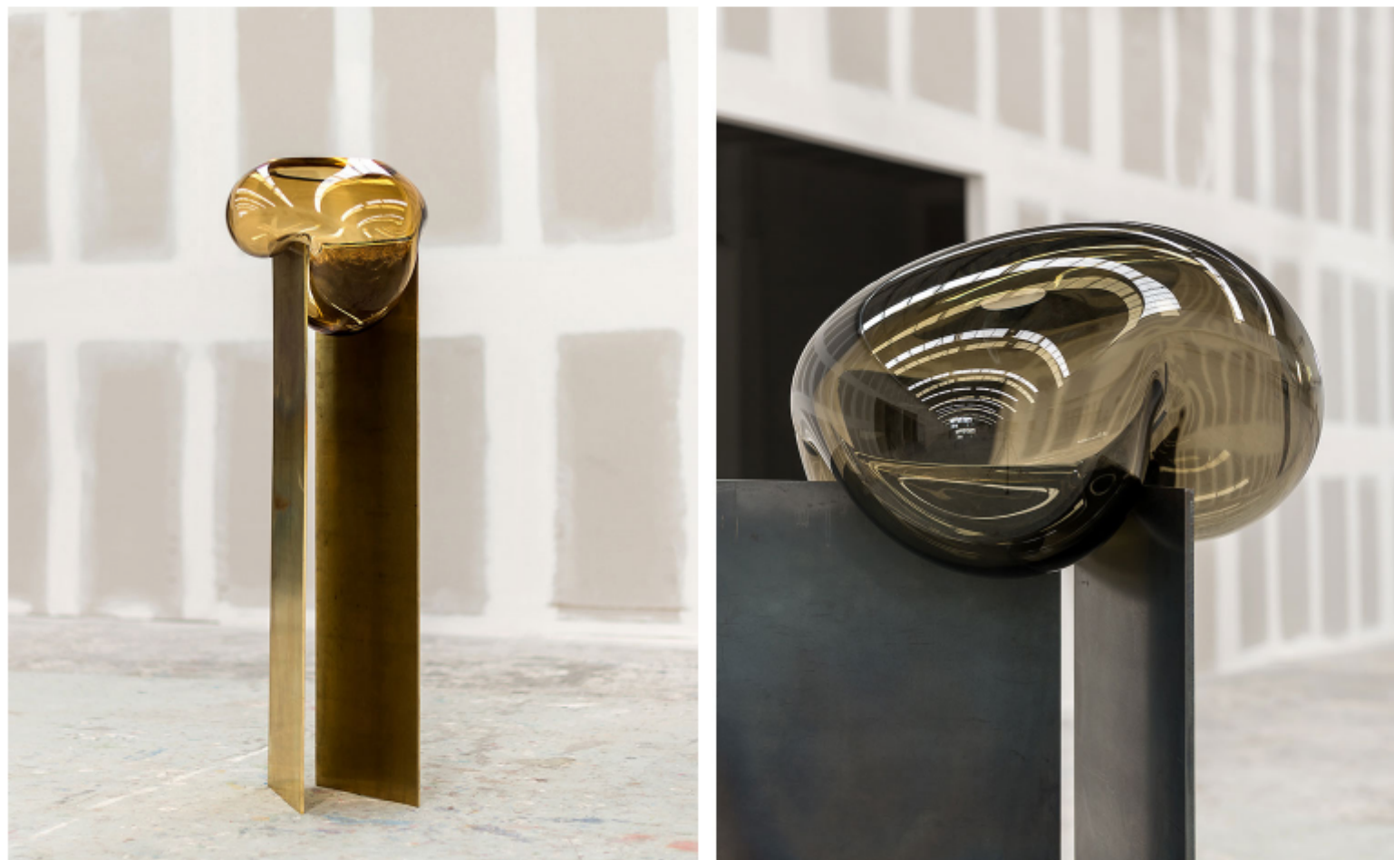
Steel, brass and stone are found in a dialogue with glass. Pictured: 'Precarius 1' and 'Precarius 5'