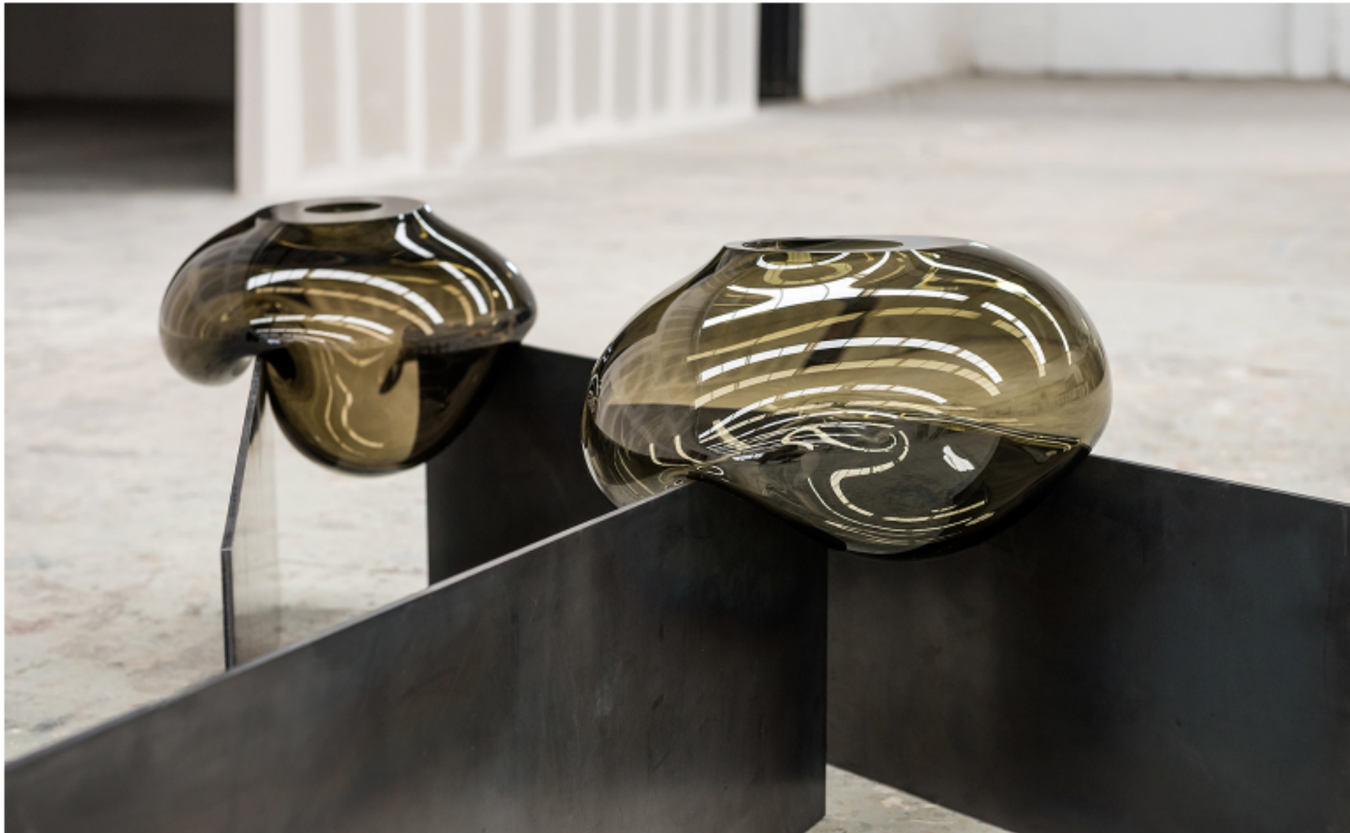
The 'Precarious' series consists of glass pieces formed around steel and brass plates, co-existing in a delicate calibration. Pictured, 'Precarius 10.'

Twitter Facebook Google+ Pinterest LinkedIn