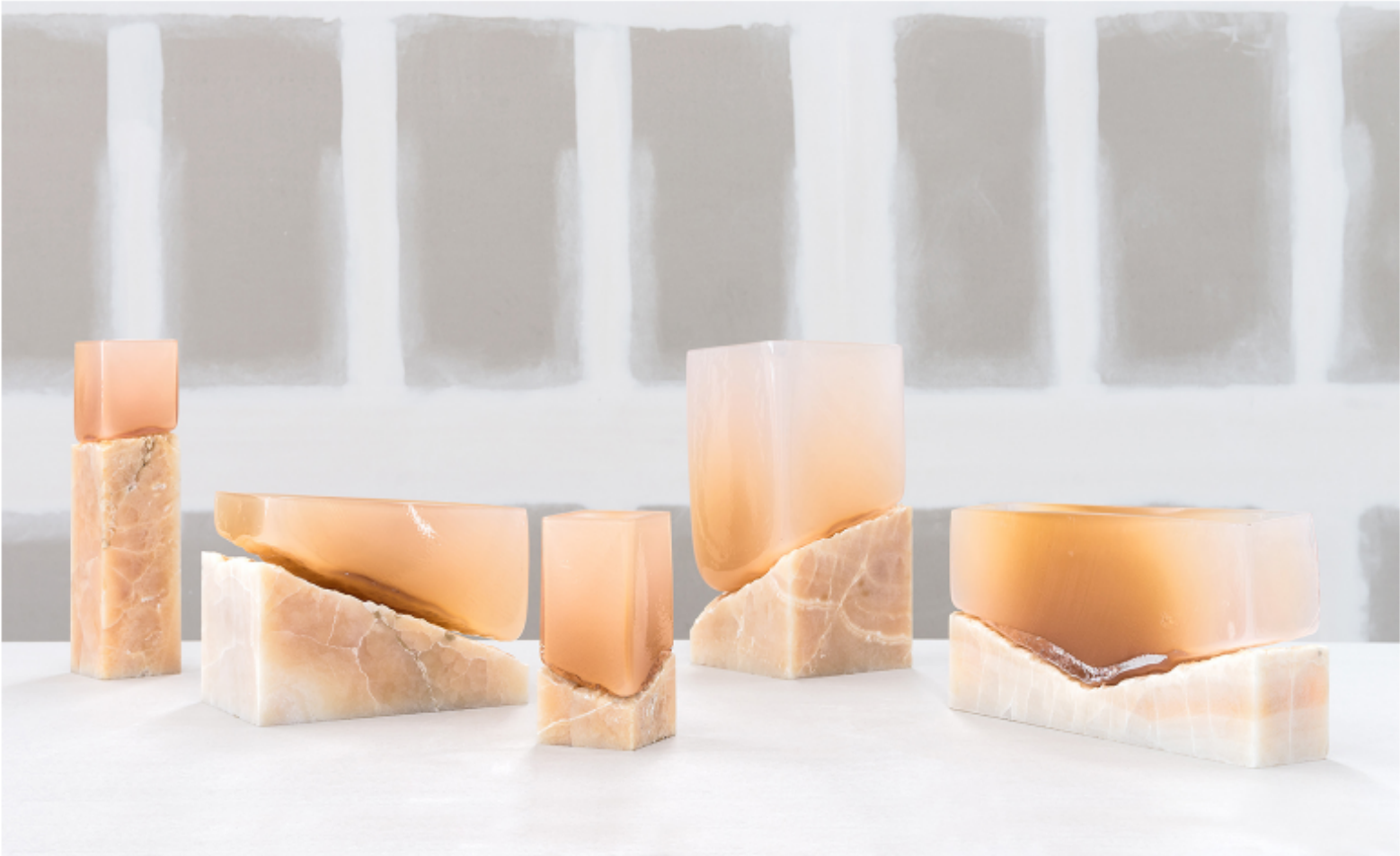
The 'Bedrock' series incorporates locally-sourced stone, combining a rough, chiseled stone pyramid with a glass cylinder, which, depending on its configuration, can be used as a side table or a vase

'We left many in-progress concepts and pieces for future collections,' explains Esrawe of the ongoing collaboration. In the midst of the North American Free Trade Agreement (NAFTA) renegotiation, this feels like a timely reminder that innovation across borders continue to advance the creative fields in exciting and, often, unexpected ways.