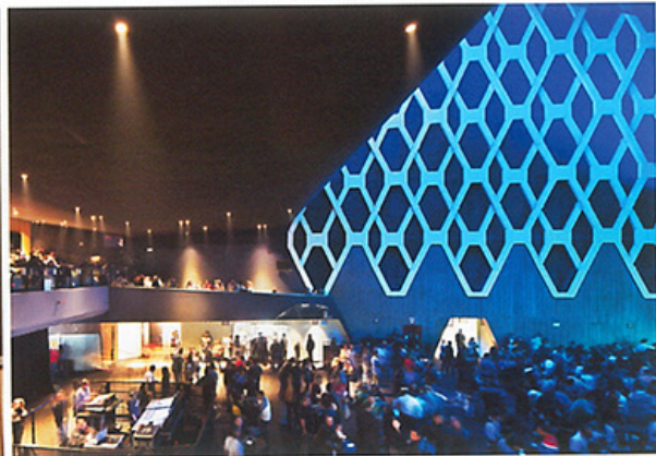
Clockwise from above: The six-story concert hall has hosted the likes of Rihanna. Circulation pathways are marble. Wainscoting from the exterior carries through to the inside. Another view of the concert hall. Niches in the lobby display sculptures and memorabilia.